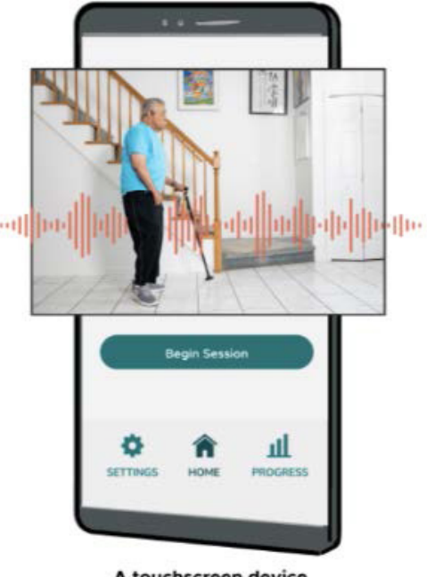
A touchscreen device pre-loaded with InTandem

To learn more about ordering for Veterans or to schedule an inservice, please contact Chrissy Stack at <u>cstack@medrhythms.com</u>.